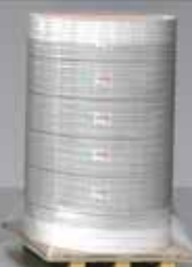
DOUBLE WRAP WITH STRIP