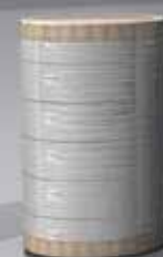
WITH FOLDED CARDBOARD HEADERS