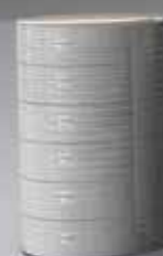
WITH SIMPLE CARDBOARD HEADERS