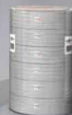
3X120° BUNDLE LABELED SYSTEM