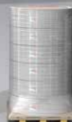
ON WOODEN PALLET